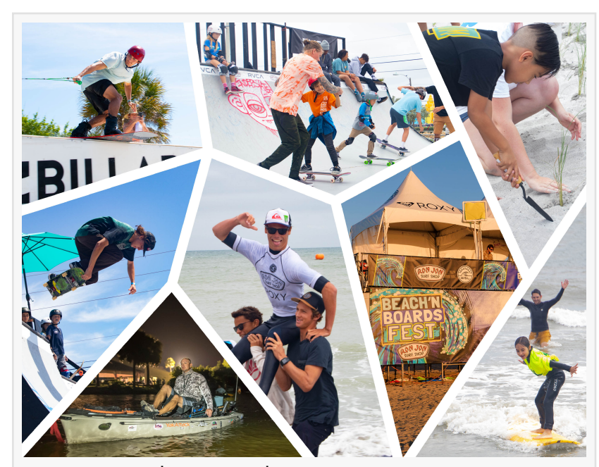
Ron Jon Beach 'N Boards Fest