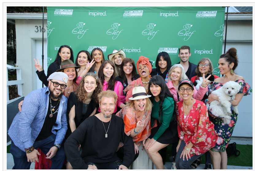
New Day New Chef Launch Party Guests on the Green Carpet!

A fabulous party in the Hollywood Hills celebrated the launch of a new TV series now streaming on Amazon Prime Video! New Day New Chef is a fast-paced, 100% plant-based cooking show that's free for Amazon Prime members! And, it's set to air on Public Television stations around the nation this spring.