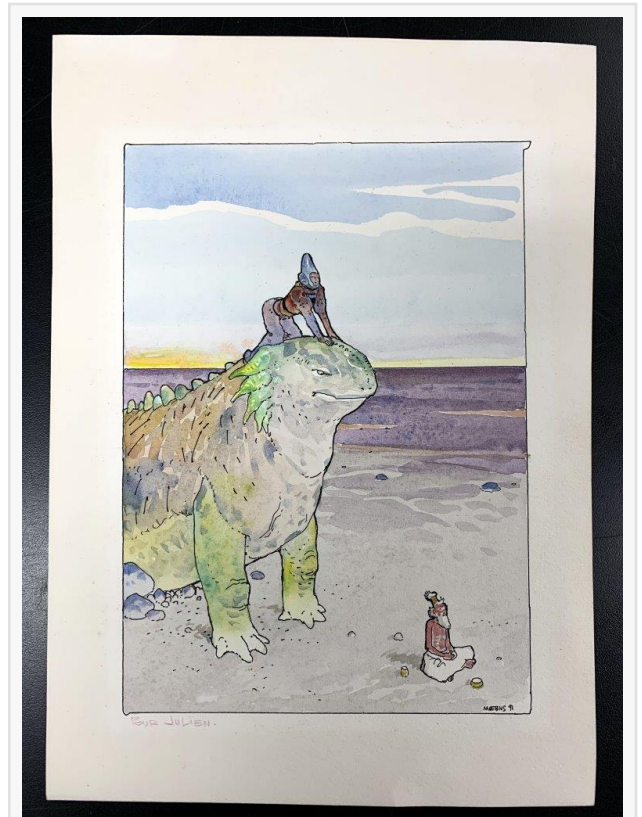
Artworks certain to attract attention include this original color illustration by Jean Henri Gaston Giraud (French, 1838-2012), who worked under the pseudonym Moebius.

This press release can be viewed online at: http://www.einpresswire.com