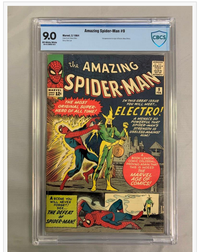
Copy of The Amazing Spider-Man #9, graded highly at 9.0 by CBCS and featuring the first appearance of the character Electro.