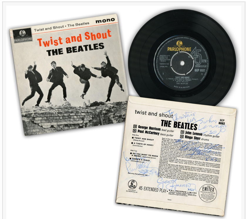
Rare first UK pressing of the Beatles' debut EP, Twist and Shout, signed by all four Beatles on the cover (est. $16,000-$18,000). The four-song EP is on the Parlophone (UK) label.

The preminent Civil War related item, an April 2, 1861 missive from Confederate Secretary of War Leroy Pope Walker to P.T. Beauregard, commander of Fort Sumter, is sure to elicit interest from collectors. Aficionados will also appreciate the World War II materials, including historical documents related to the Enola Gay, Bockscar, Colonel Paul W. Tibbets, and the Atomic Bomb.