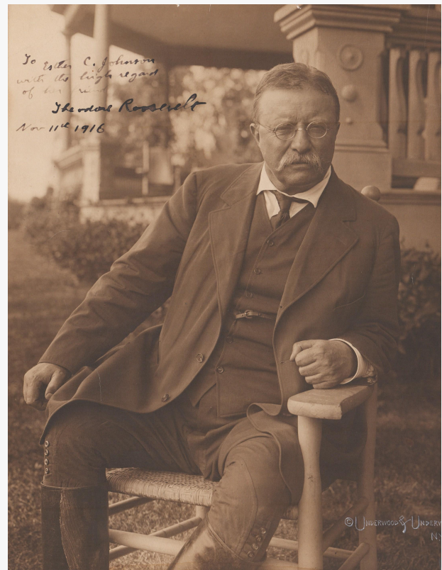
Signed photo of Theodore Roosevelt, post-presidency, showing him with a look of grim determination, 10 ¼ inches by 13 ½ inches, signed and inscribed (est. $2,400-$2,600).