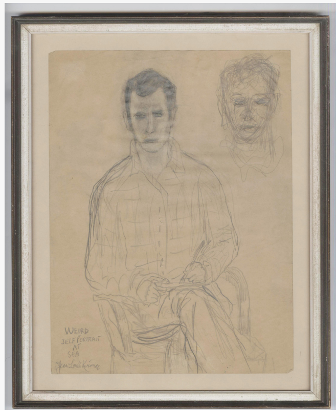
Pencil drawing by Beat Generation writer Jack Kerouac titled Weird Self-Portrait at Sea , signed by Kerouac as "Jean Louis K rouac" (est. $4,000-$5,000).