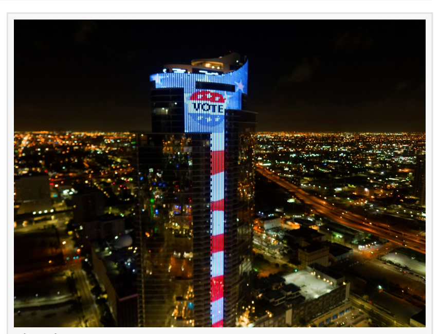
Florida Primary Stars, Stripes & Vote Animation Display on 700-foot, $600-Million Paramount Miami Worldcenter Skyscraper | Vivid Reminder Election Day Not Cancelled Due to COVID-19

The massive stars and stripes illumination display appears on the new 700-foot tall, 60-story, $600-million Paramount Miami Worldcenter. It is the world's most heavily-amenitized futuristic luxury residential skyscraper, which features the world's most technologically-advanced light emitting diode (LED) animation system and America's first Jetsons-Style flying cars SkyPort.