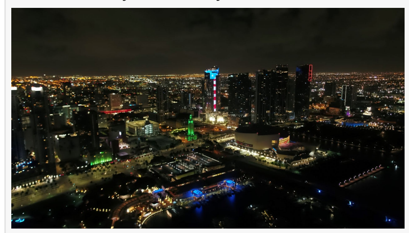
Paramount Miami Worldcenter Glowing in Stars & Stripes Seen From Biscayne Bay for Florida Primary

future with an hydraulic floor that will rise; enabling water to seep-down around the edges, creating an oval-shaped take-off and landing pad for flying cars.