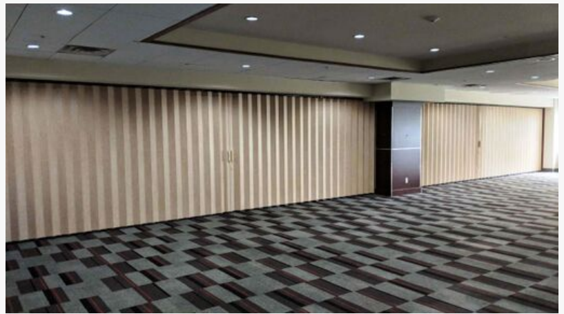
Dividing spaces at an international hotel

This press release can be viewed online at: http://www.einpresswire.com