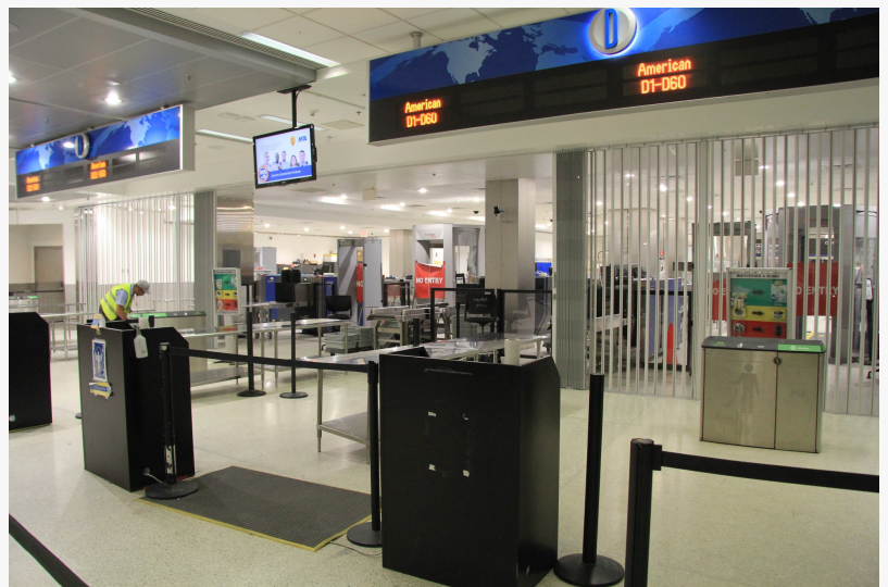
Security maintained, when needed, using Woodfold Accordions in Miami