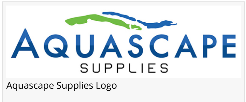
Aquascape Supplies Logo

If any signs of disease are seen, start using Pond Salt immediately and start feeding with medicated fish food. If things look like they are getting worse, immediately treat the pond with the appropriate treatment. The longer you wait to treat the problem, the less chance you have of saving your fish.