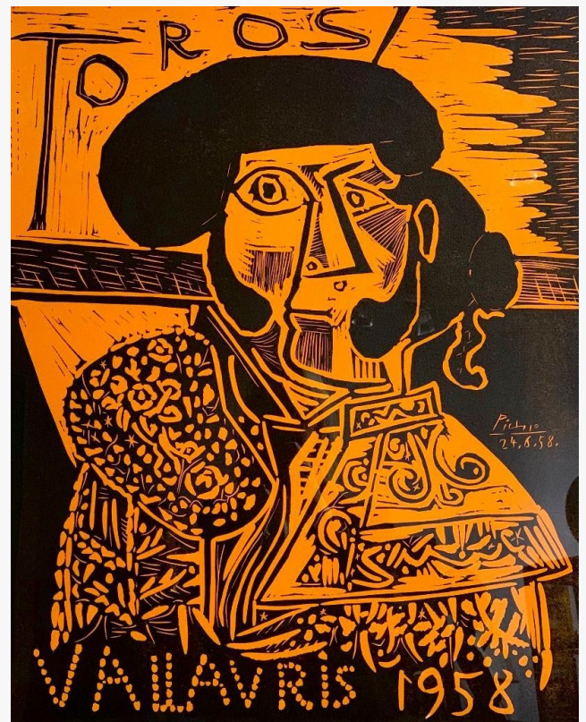
Toros Vallauris, a linocut in print depicting a bullfighter and signed in red crayon by Pablo Picasso (Spanish, 1881-1973) measuring 35 ½ inches by 29 ½ inches framed ($19,680).

This press release can be viewed online at: http://www.einpresswire.com