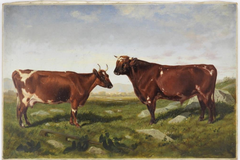
19th century English School Realist rendering of a prize bull and heifer standing in a pasture identified as "Ayrshire Lad" and "Miss Morton", dated 1862 ($6,875).