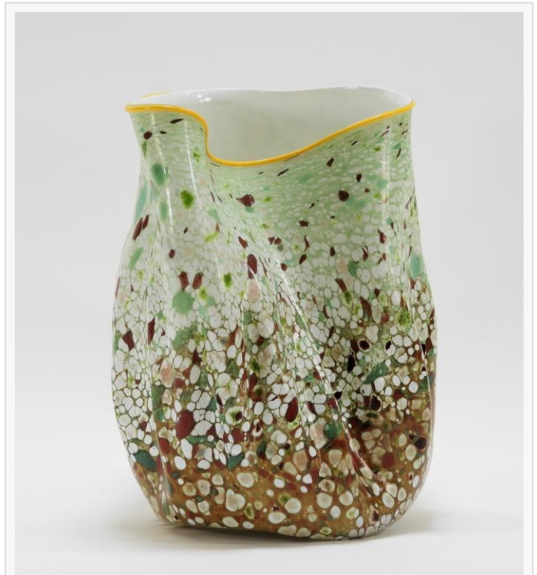
Macchia art glass vase by Dale Chihuly (American, b. 1941), organic folded form with earth tone brown and green splatter over a cream ground, 12 \frac{3}{4} inches tall ($6,250).

This press release can be viewed online at: http://www.einpresswire.com