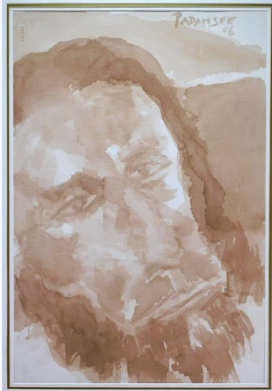
Contemporary watercolor on paper portrait painting by Akbar Padamsee (Indian, 1928-2020), depicting the face of a somber gentleman in soft sepia tones ($6,250).