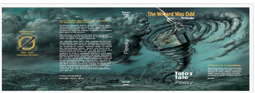
Dust Jacket and Cover for Toto's Tale, a Limited Edition

TAMPA, FL, UNITED STATES, March 25, 2020 /EINPresswire.com/ -- In this 450 page illustrated eBook, Toto tells the reader "like it is"! To quote, "...every monkey and his uncle who was smart enough to hold the sharp end of a pencil to paper, has shared their