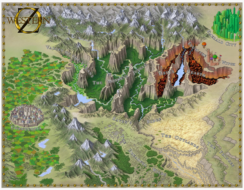
Original Art - Wizard Was Odd Trilogy, Book Two: Trail of Tears, (Wizard of Oz from Toto's Perspective)

This press release can be viewed online at: http://www.einpresswire.com