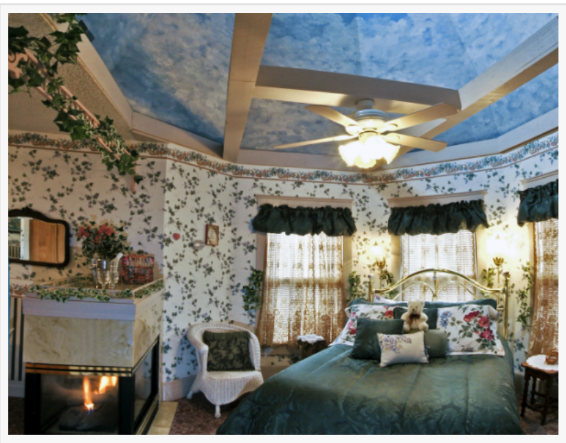
Each suite at Holden House is individually decorated and offers romantic surroundings

To make a reservation, visit <a href="https://www.HoldenHouse.com">www.HoldenHouse.com</a> and click on make reservation/check availability. After selecting your room, you will be able to add and apply the "Early Bird"