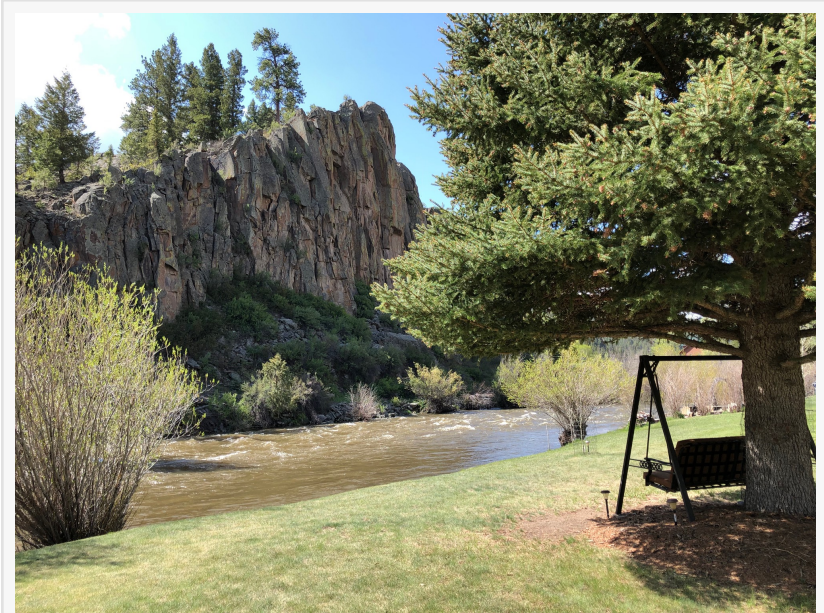
The Arbor House in South Fork is just one of the many great choices for booking a plan ahead vacation

COLORADO SPRINGS, COLORADO, UNITED STATES, March 23, 2020 /EINPresswire.com/ -- Bed & Breakfast Innkeepers of Colorado member inns are dedicated to clean and comfortable accommodations, taking guest health and safety seriously every day. While the current health situation and COVID-19 has created much uncertainty across the nation, especially in the hospitality industry, bed and breakfasts offer an added benefit as small properties. First and foremost, size matters and because B&Bs are small in the number of guest accommodations, they also provide more social distancing space.