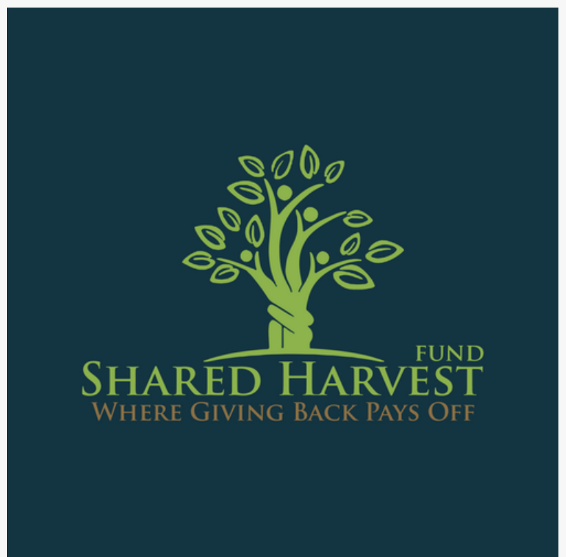
Shared Harvest Logo

CHPs and other nonmedical volunteers involved in the task force will also be eligible for student debt relief or emergency savings funds as a reward for their service through Shared Harvest's fintech platform.