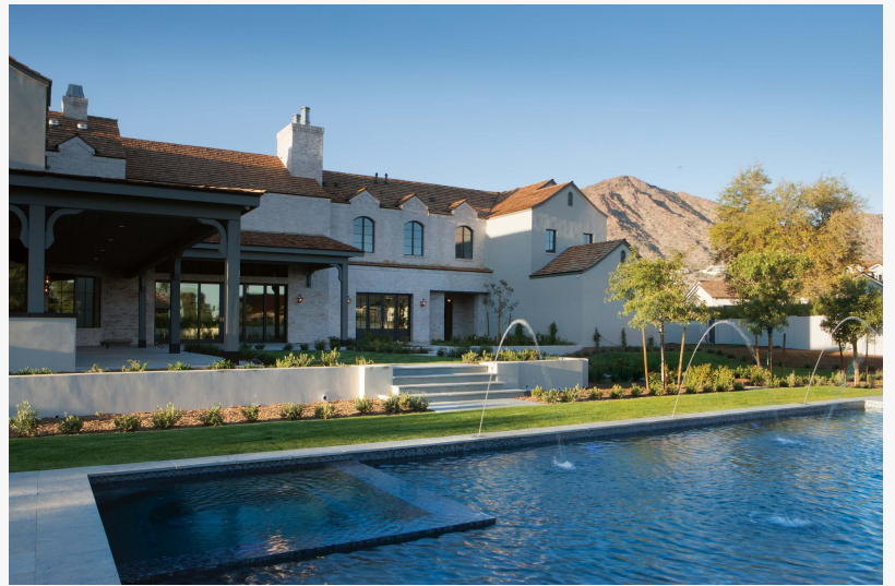
Custom Luxury Pool Builder Liquid Evolution Pools in Scottsdale AZ

While the construction can vary, Liquid Evolution Pools is one company that can offer you a dependable timeline, as well as an entirely different approach that means your backyard pool is far more than a simple add-on, it's an addition to your lifestyle. So, what does a Liquid Evolution Pools custom luxury pool look like from start to finish? Take a peek.