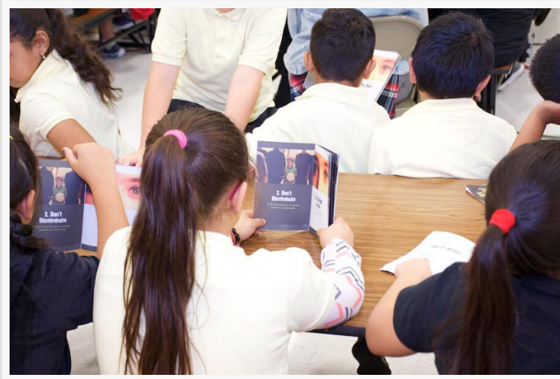
Students reading the popular "What are Human Rights" booklet. Free copies of this booklet can be mailed anywhere in the world by going to www.youthforhumanrights.org

Students can quickly embark upon the path to human rights learning with the free Youth for Human Rights online Ecourse. This free interactive course will introduce students to their human