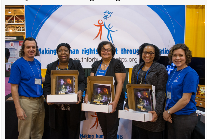
Teachers around the country use the Youth for Human Rights materials in their classrooms. These can be just as easily used at home by parents.

rights so that they will know them well enough to defend them for themselves and others. Students can sign up for the free e-course by going to <a href="https://www.youthforhumanrights.org/course/">https://www.youthforhumanrights.org/course/</a>.