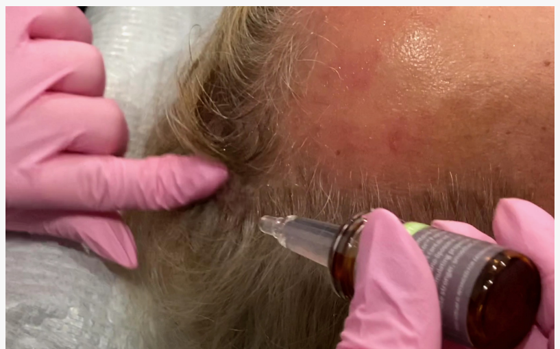
Applying KeraFactor to the Scalp after LaseMD Ultra treatment

KeraLase has been shown to improve the hair densities and hair shaft thickness in early studies. The overall scalp health also improves using an objective grading scale.