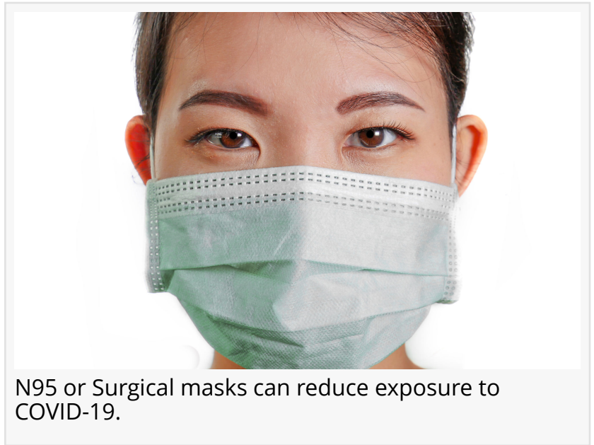
N95 or Surgical masks can reduce exposure to COVID-19.

VI. Employers/businesses may wish to provide sanitizing wipes for employee keyboards, and desktops, etc., and tissue for employees to catch sneezes, etc.