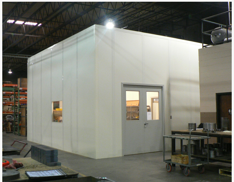
Isolation Room with Negative Pressure HEPA Filtration & UV Light