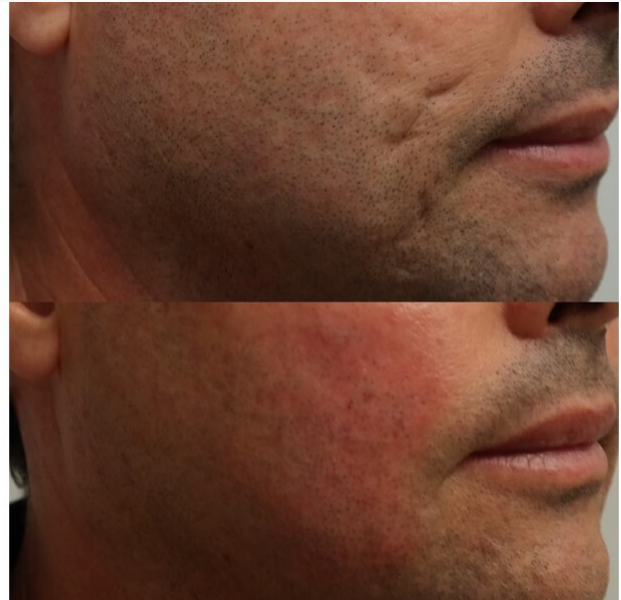
Treatment with Bellafill and Subcision

TCA CROSS: TCA is a chemical peeling agent that leads to collagen stimulation during the healing process. CROSS stands for chemical reconstruction of skin scars. Using 80-100% TCA, ice pick or