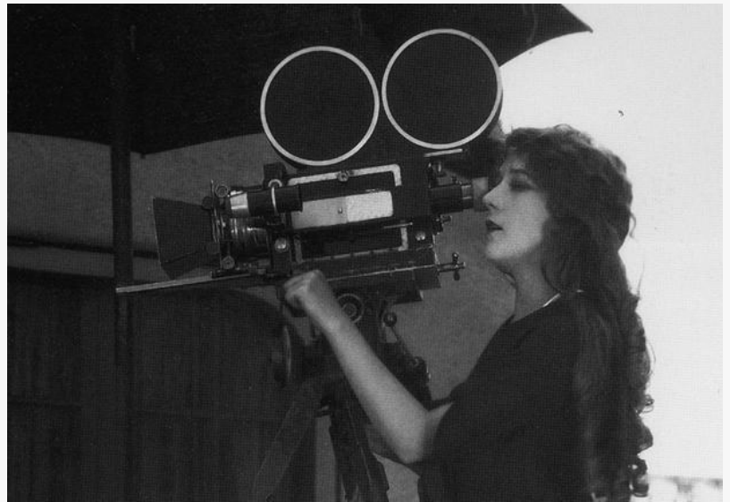
Mary Pickford - Behind The Camera

'America's Sweetheart' is a feature film biopic about an iconic figure in the history of film: Mary Pickford. Standing up for what is right, she demanded to be paid fairly for her work, which was unheard of at the time. But her growing success as an actress and her tenacity as a business-savvy producer came at a price. Mary Pickford had to use her passion and talent to achieve her goals, and as a result she helped build Hollywood from the ground up. She is a trailblazer that the world needs to be more aware of. ----- -----