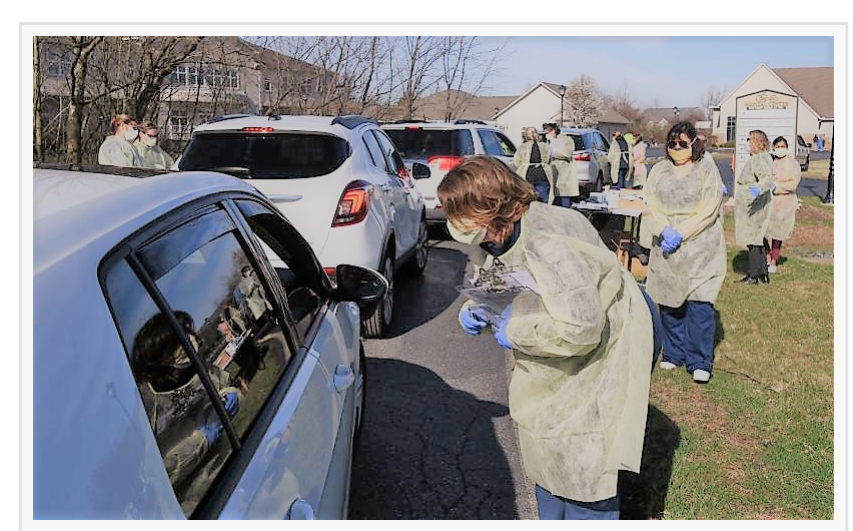
Lines of nurses dressed for COVID-19 screening

You reflect and be proud for having made a difference to a very appreciative nurse; And then,