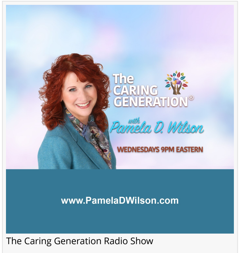
The Caring Generation Radio Show