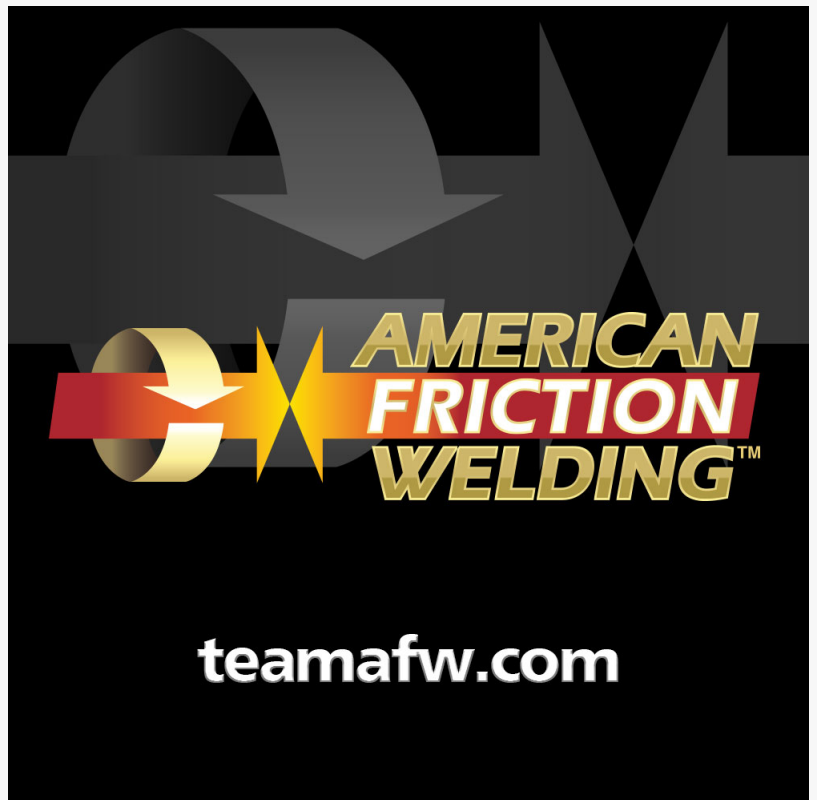
American Friction Welding Logo

American Friction Welding technology to serve and provide the best value to our customers."