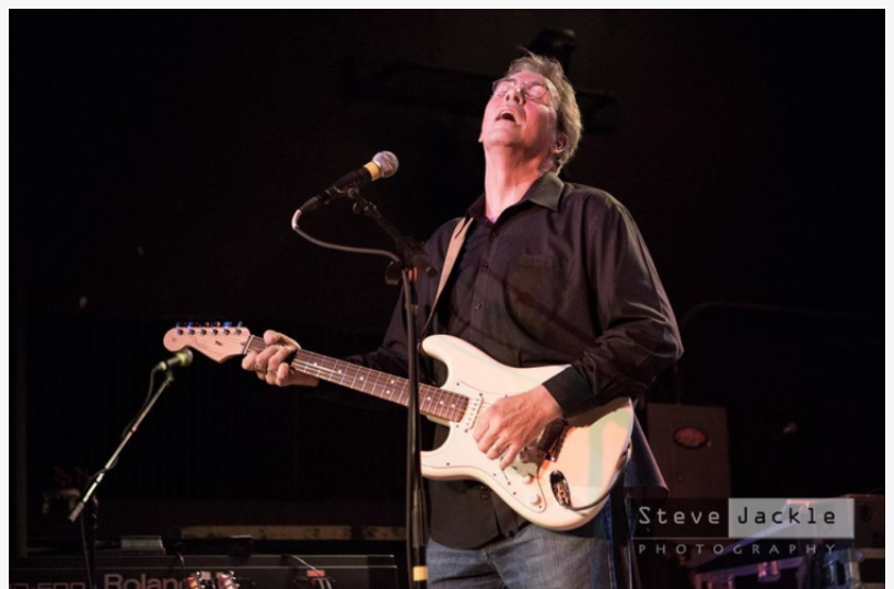
Harvey Dalton Arnold