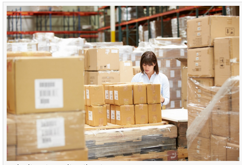
Labeling in a distribution center

Metka Silar Sturm NiceLabel + +386 42805017 email us here Visit us on social media: Facebook Twitter LinkedIn