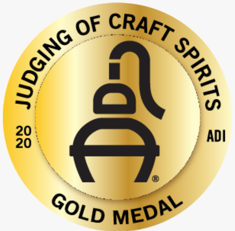
ADI Gold Medal 2020

This press release can be viewed online at: http://www.einpresswire.com