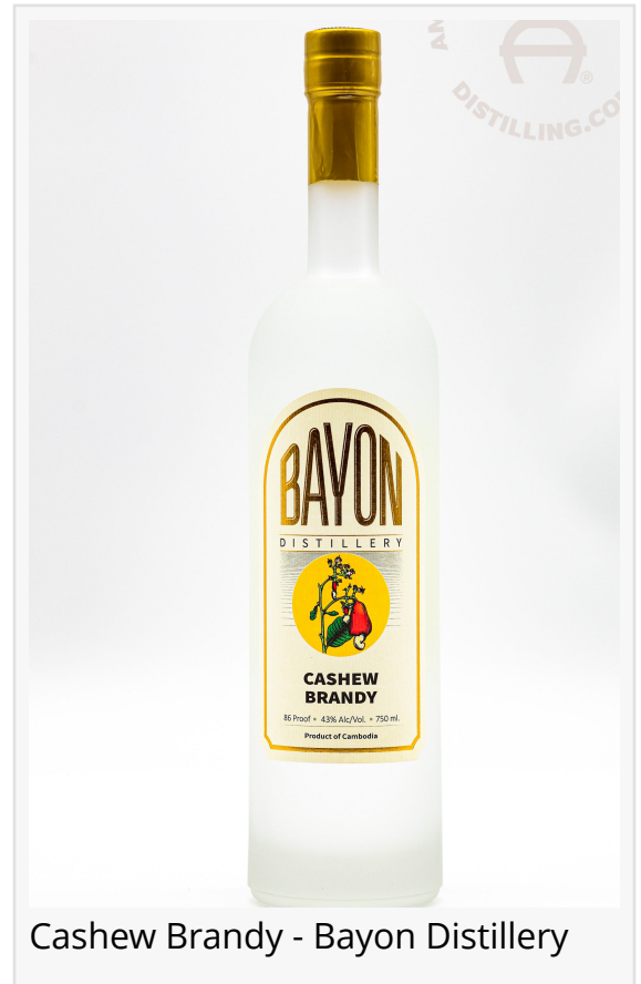
Cashew Brandy - Bayon Distillery

Forbes Magazine Covers ADI 2020 Competition