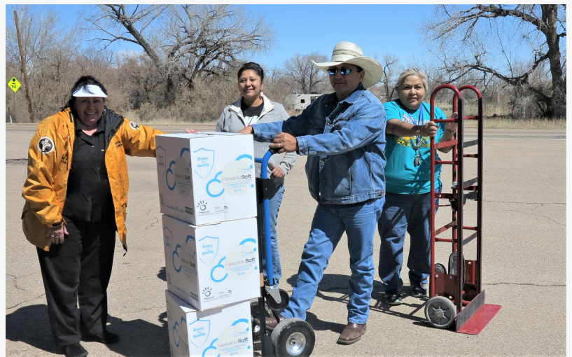
Delivering needed goods donated by Latter-day Saints Charities & Churches of Scientology Disaster Response to Native Americans in northeast Utah.

This press release can be viewed online at: http://www.einpresswire.com