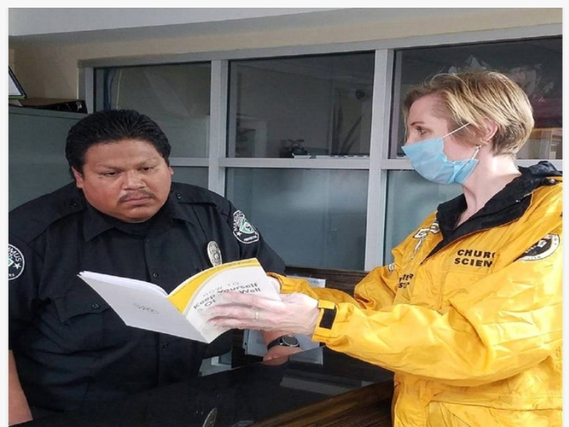
Sharing "How to Keep Yourself & Others Well" booklet with a security guard at a local hospital.