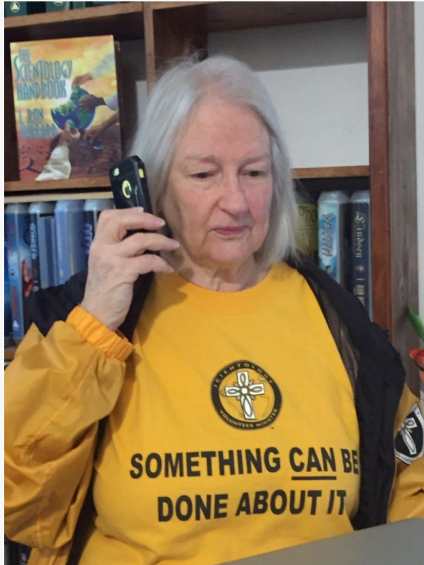
Teleconferencing from home to help others in need.