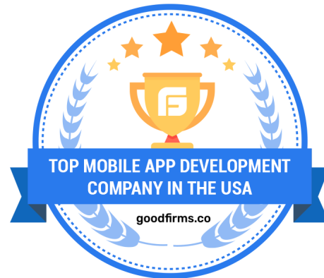
Top Mobile App Development Company in the USA

WASHINGTON DC, WASHINGTON, UNITED STATES, April 10, 2020 /EINPresswire.com/ -- Swenson He holds a good market reputation as a reliable mobile application development service company based in the USA. It helps the businesses to build outstanding iOS, Android, and Hybrid applications as per their requisites. For the same reason, Swenson He has grabbed the place among the list of top US-based mobile application development companies by GoodFirms.