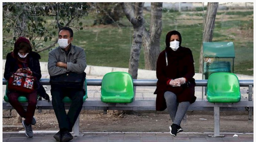
Coronavirus outbreak in Iran