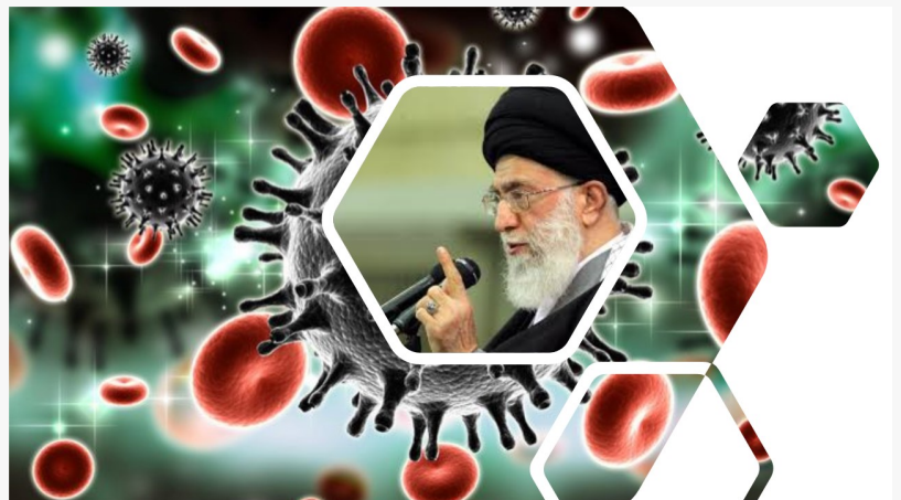
Iran The Epicenter of Coronavirus and Its Expansion to World