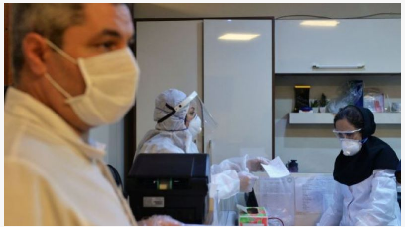
Coronavirus outbreak in Iran Medical Staff