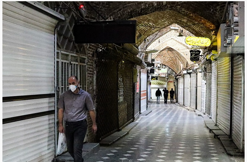
Coronavirus outbreak in Iran Streets