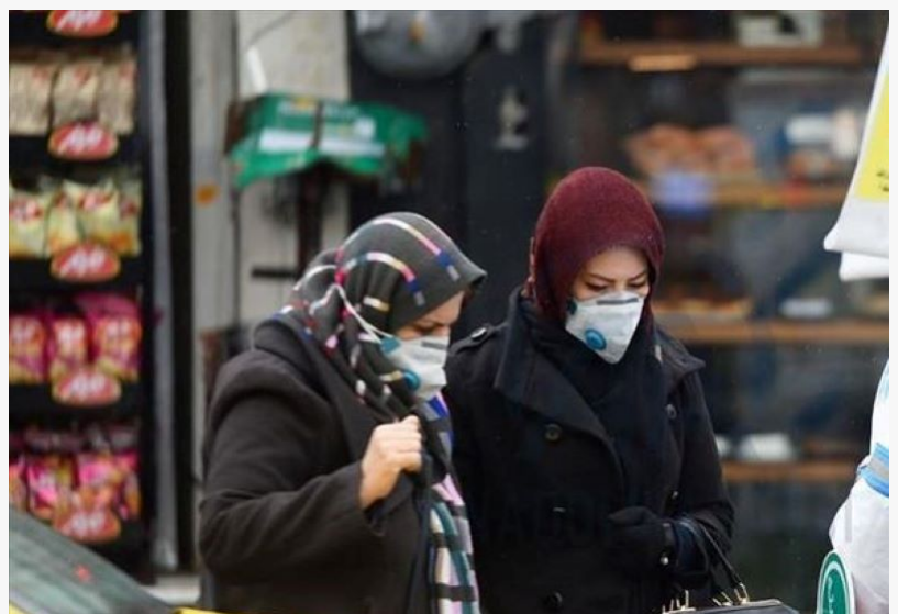
Coronavirus outbreak in Iran Streets