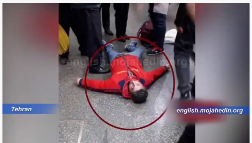
A Heartbreaking picture of people in Iran, passing out due to coronavirus

Yahya Al-Ishaq, former Minister of Commerce and Chairman of the Iran-Iraq Joint Chamber of