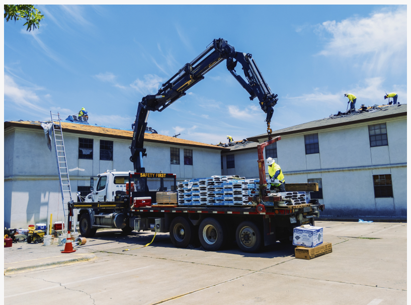
McAllen Valley Roofing Co. roofing contractors repairing a damaged apartment complex.

Del Rio Service Area McAllen Valley Roofing Co. +1 830-215-8166 email us here Visit us on social media: Facebook Twitter LinkedIn