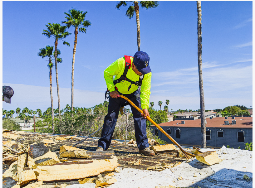
McAllen Valley Roofing Co. worker replacing a damaged commercial roof.

This press release can be viewed online at: http://www.einpresswire.com