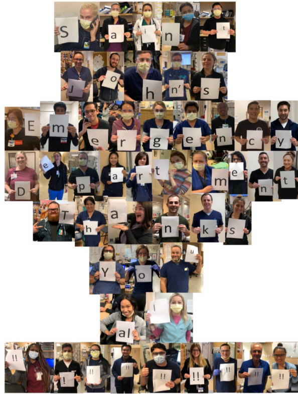
Saint John's Thanks You Coral Tree Cafe