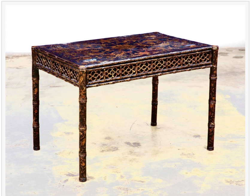
Early 19th century Chinese Export black and gilt lacquer games table, having a top with four counter recesses, the reticulated frieze fitted with a single drawer (est. $1,200-$1,800).

Fine designer jewelry and watches from Audemars Piguet, David Yurman, John Hardy, Judith Ripka, Rolex, Tiffany & Co. and others, in a wide array of price points, will entice buyers. A pair of