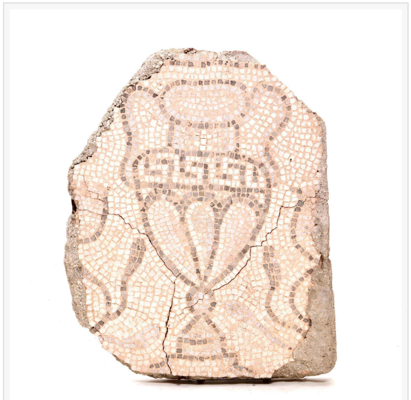
Late Roman mosaic panel of an urn, probably 4th century C.E., 25 ½ inches tall (est. $2,000-$4,000).

Aileen Ward Andrew Jones Auctions +1 213-748-8008 email us here