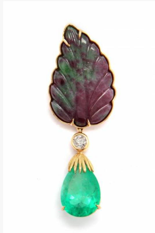
Tony Duquette carved ruby in fuchsite, emerald, diamond and 18k gold brooch, 2 3/4 inches by 1 inch, signed Tony Duquette (est. $2,500-$3,500).