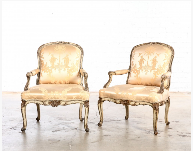
Pair of Louis XV style paint decorated fauteuils from the second half 20th century, each one 28 inches tall by 28 ½ inches wide (est. $800-$1,200).

This press release can be viewed online at: http://www.einpresswire.com