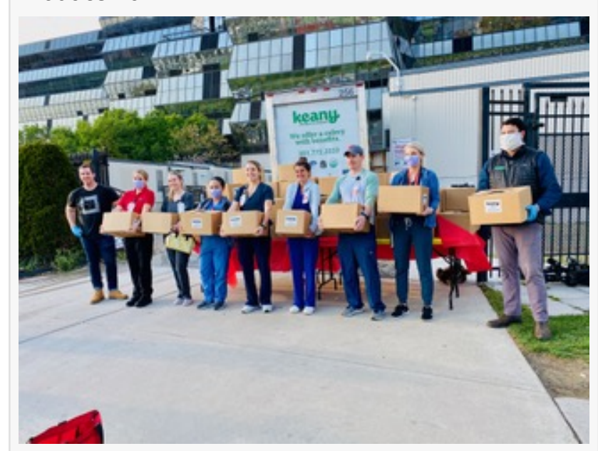
hildren's Hospital Workers quickly gather produce boxes delivered by Produce Alliance and Keany Produce and Gourmet