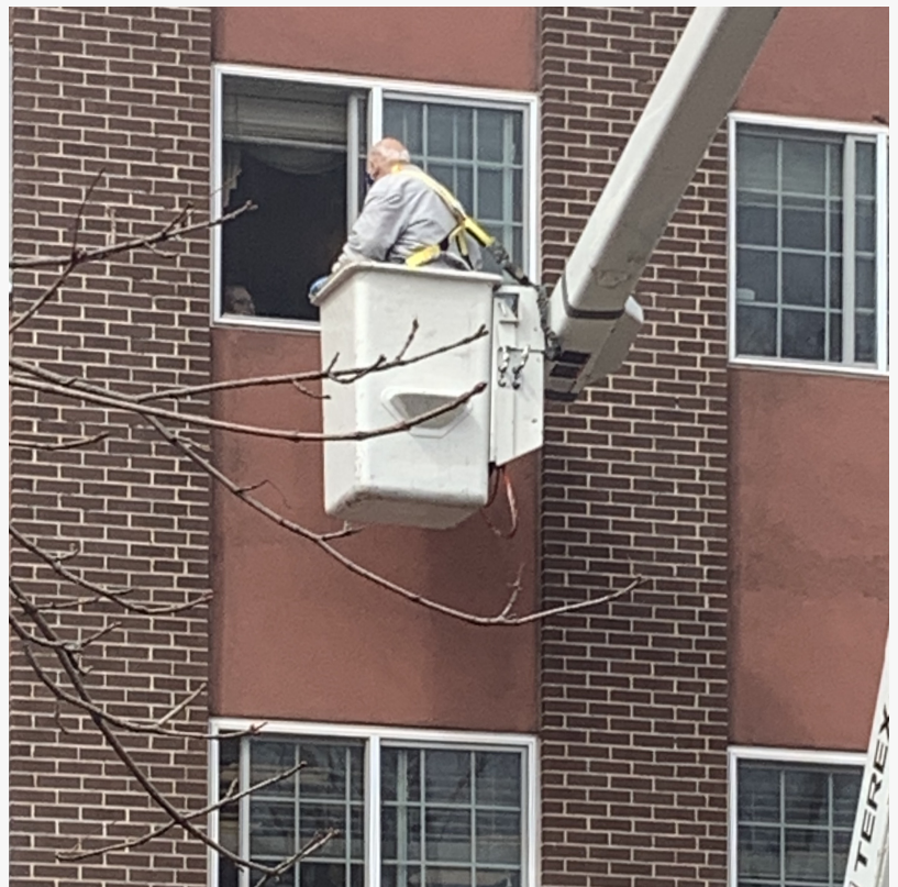
Reunited at Last