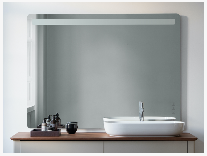
Duravit's Luv Mirror

the L-Cube mirrors with tranquility and simplistic beauty at the forefront. Featuring a "frame of light" this collection's mirror solutions combine simplicity in design and impact through technology; illumination is afforded by a simple hand motion to turn on and turn off the light emanating from behind the mirror. Featuring 480-Lux LEDs, the L-Cube mirrors afford glare-free illumination and are further equipped with a dimmer to adjust light to desired brightness. These mirrors coordinate beautifully with Duravit's L-Cube furniture series as well as all other Duravit product collections.