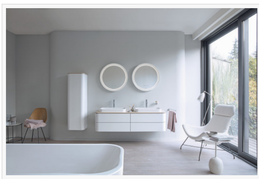
Duravit's Happy D.2 Plus Mirrors

ATLANTA, GEORGIA, USA, April 15, 2020 /EINPresswire.com/ -- <u>Duravit</u> USA, a leading manufacturer of designer bathrooms, is shining the spotlight on its versatile range of mirrors. Driven by technology and great design, the German-founded brand offers a variety of best-in-class solutions across style, dimension and price point. From the signature circular shape of the <u>Happy D.2 Plus</u> collection to the more rectangular <u>XSquare</u>, characterized by its chrome elements, the mirrors are a