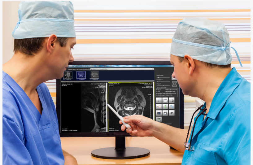
Doctors using MatrixRay to view images as part of Nautilus Medical Technologies complete telehealth and telemedicine platform.