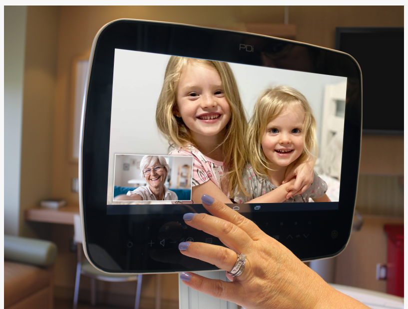
Senior living resident using TeleRay and PDi Communication unit during Covid19 pandemic.

About PDi Communication Systems, Inc: Ohio-based PDi is celebrating 40 years as the US leader in design and manufacture of the most versatile, complete hospital TV and tablet display systems. Designed for stringent hospital cleaning standards for infection control, our products range from 14" touch screen mobile TV carts, to 19" bedside displays mounted on arm systems up to 72" reach, and Smart wall TVs from 24" thru 55" screen sizes. PDi provides enhanced entertainment and communication solutions to improve the patient experience with smart technology for many healthcare settings. With 1,000,000 TVs sold, many healthcare managers appreciate the proven PDi product features and guaranteed installation by PDi ProServices. For more information, please contact Marisa Vilardo, mvilardo@pdiam.com or Cat Saettel.