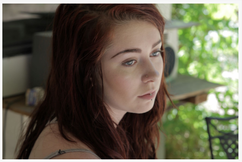
It took years for the filmmakers to find young adults willing to go on camera to tell their stories as many did not want to talk about being brainwashed to hate a parent after divorce, due to shame.

The film has over 26,000 followers on its Facebook page as "erased" parents see this film as their last hope to communicate with their children. More than 300 backers raised over