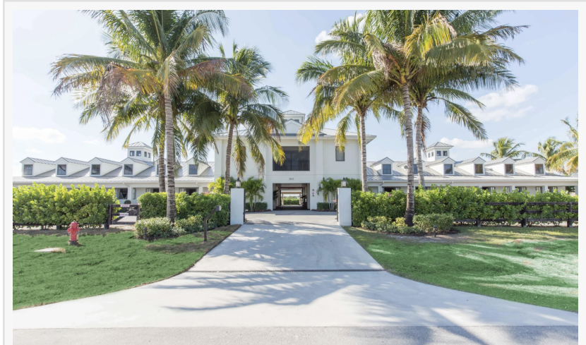
3905 Gem Twist Court | Wellington, FL

/EINPresswire.com/ -- Located within the exclusive equestrian community of the Grand Prix Village, 3905 Gem Twist Court will auction online next month via Concierge Auctions in cooperation with Travis Laas of Engel & Völkers. Previously offered for $9.6 million, the property will sell with a Reserve of $5.3 million. Bidding will be held May 19–22nd via Concierge Auctions' online marketplace, ConciergeAuctions.com , allowing buyers to bid digitally from anywhere in the world.