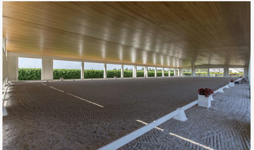
3905 Gem Twist Court | Wellington, FL