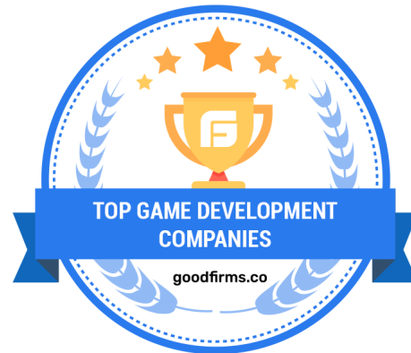
Top Game Development Companies

Logic Simplified Appingine Builbox Developers Kmphasis Infotech RV Technologies Software Pvt Ltd BEETSOFT Co., Ltd