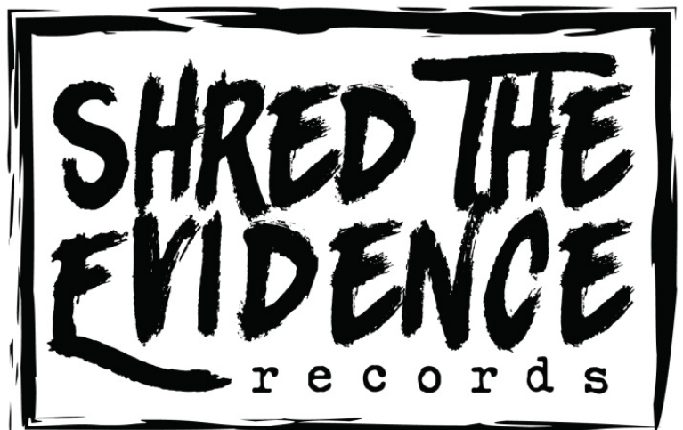
Shred the Evidence Records