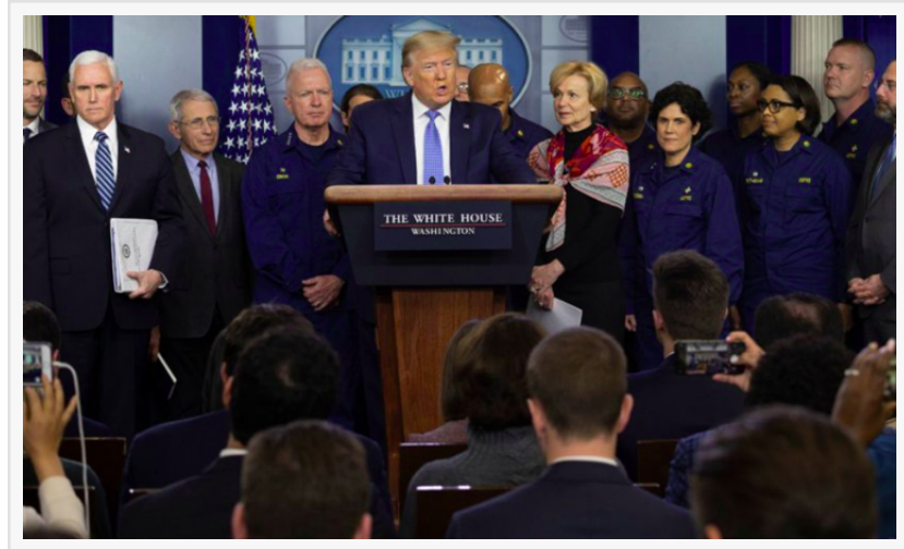
President Trump and the Corona Virus Task Force