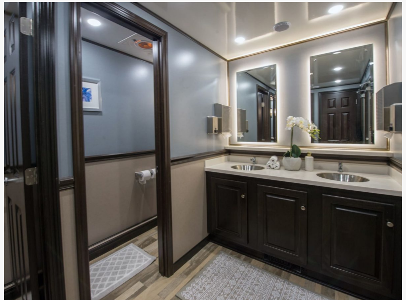
A Royal Flush

Based in Bridgeport, CT, A Royal Flush has been supplying hospitals, testing centers, construction sites, city parks, and emergency service providers with hand sanitizer stands, hand washing stations , portable restrooms, and restroom trailers. For individual convenience, the company has provided first responders and government employees in the region with thousands of user-friendly hand sanitizer sprays.