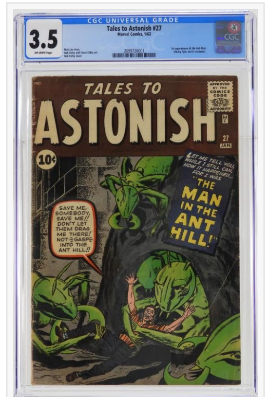
This copy of Tales to Astonish #27 (Jan. 1962), featuring the first appearance of the Ant-Man, graded CGC 3.5, changed hands for a record $3,875.

Travis Landry Bruneau & Co. Auctioneers +1 401-533-9980 email us here