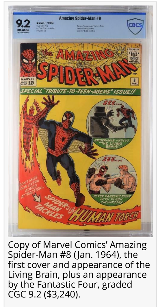
Copy of Marvel Comics' Amazing Spider-Man #8 (Jan. 1964), the first cover and appearance of the Living Brain, plus an appearance by the Fantastic Four, graded CGC 9.2 ($3,240).

This press release can be viewed online at: http://www.einpresswire.com