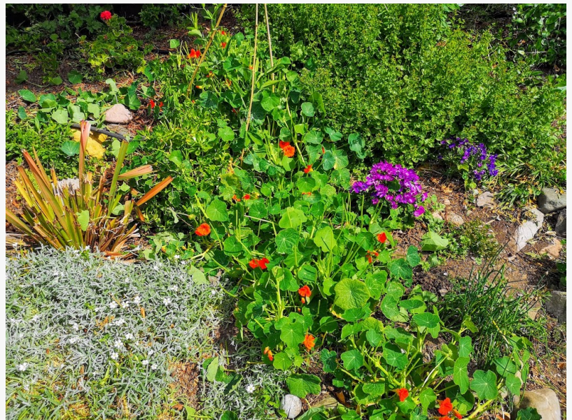
Krunchie's Garden, 23 April 2020

interpretations and historical readings.