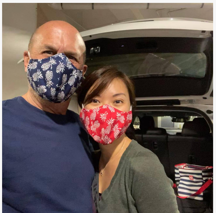
Hilo Hattie Face Masks