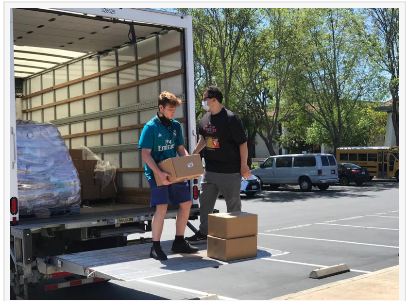
Volunteers unload more supplies from a truck