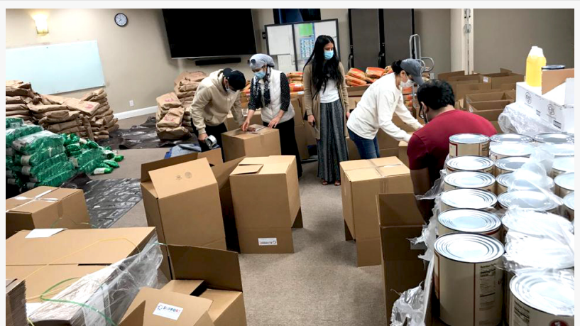
Volunteers set up boxes for packing among pallets of food and supplies at the San Ramon Valley Islamic Center.

A vital aspect of this program is that volunteers will hand-deliver these packages to people's