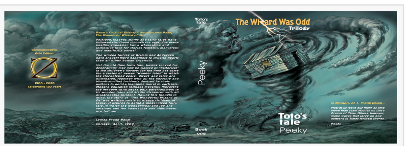
Dust Jacket and Cover for Toto's Tale, a Limited Edition

TEMPLE TERRACE, FL, UNITED STATES, April 24, 2020 /EINPresswire.com/ -- In 450 pages, Toto tells the reader like it is. "For 120 years, every monkey and