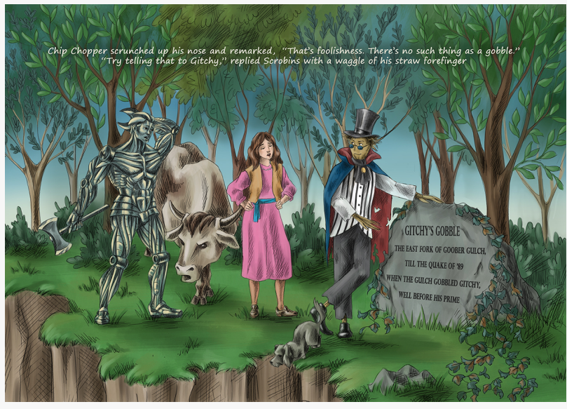
Original Art - Wizard Was Odd Trilogy (Wizard of Oz from Toto's Perspective)

game-minded fans into an Oziian world unlike any other.