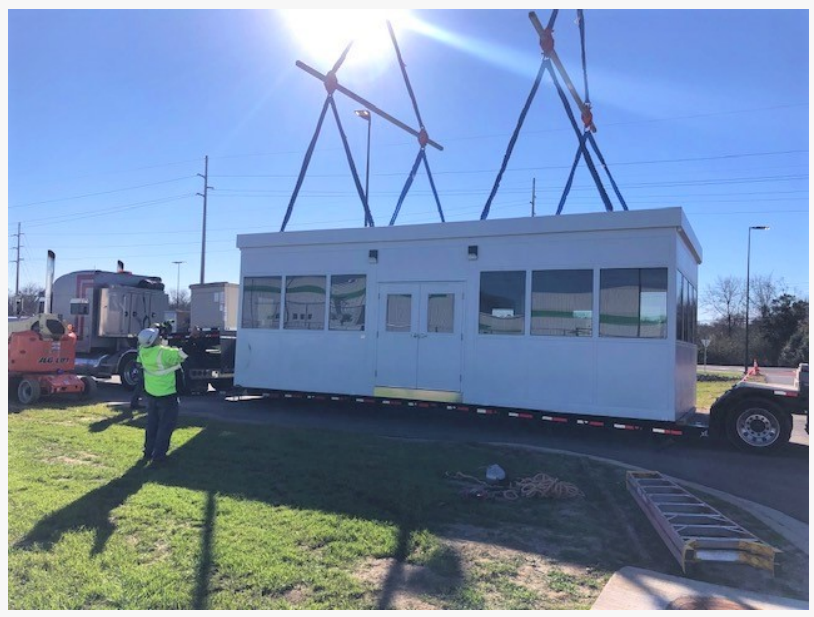
Modular Security Building Delivery Irving GA

by an innovative new security system. The fast track nature of this expansion lead them to employ <u>modular construction</u> techniques to provide a high security guard station at the entrance to check in visitors and truck drivers. The <u>prefab guardhouse</u>, supplied by <u>SafeSpace Buildings</u>,