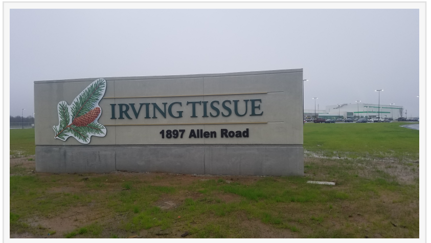
Entrance to Irving Tissue Macon GA

Access to the facility is being controlled