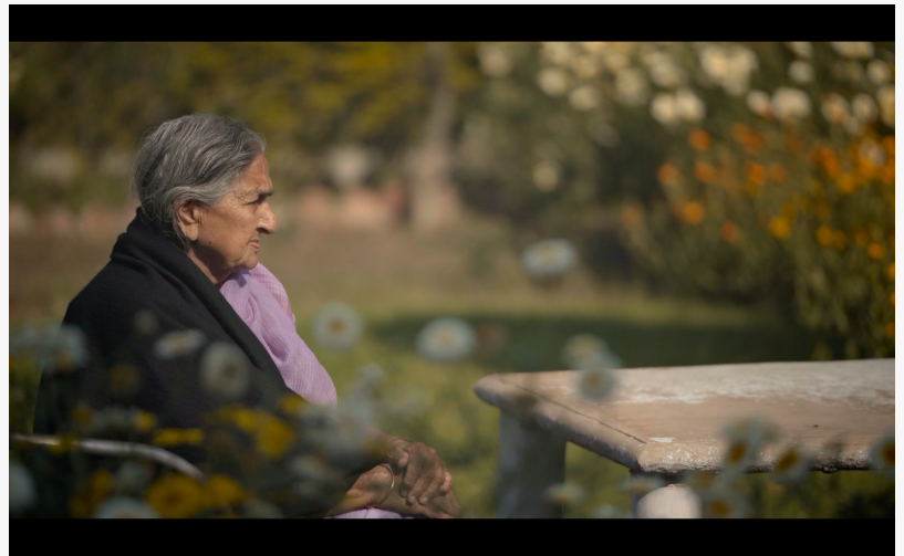
Aunty Sudha Aunty Radha by Tanuja Chandra

https://www.nycindieff.com/festival/film/tale-of-rising-rani