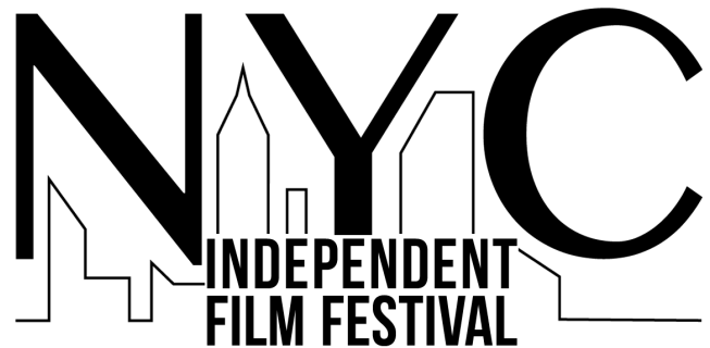
Logo NYC Independent Film Festival

Every year there are hundreds of international filmmakers who contribute to the festival. This year India has a big part in that. Here are some of the titles of Indian filmmakers that you will be