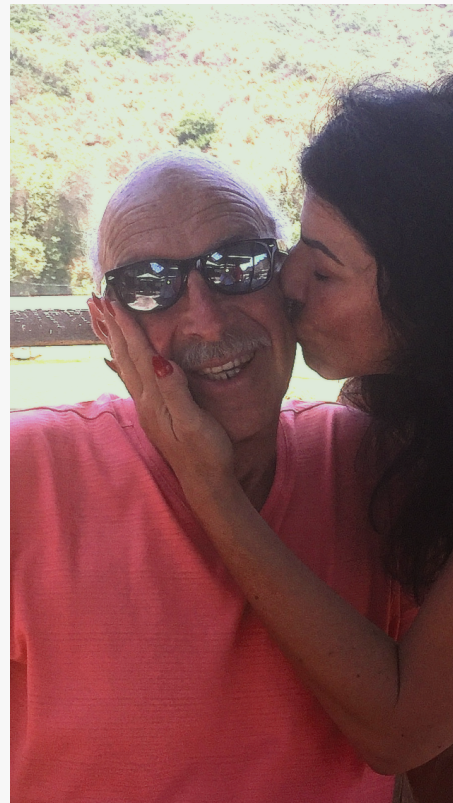
A 83rd birthday kiss.

This press release can be viewed online at: http://www.einpresswire.com